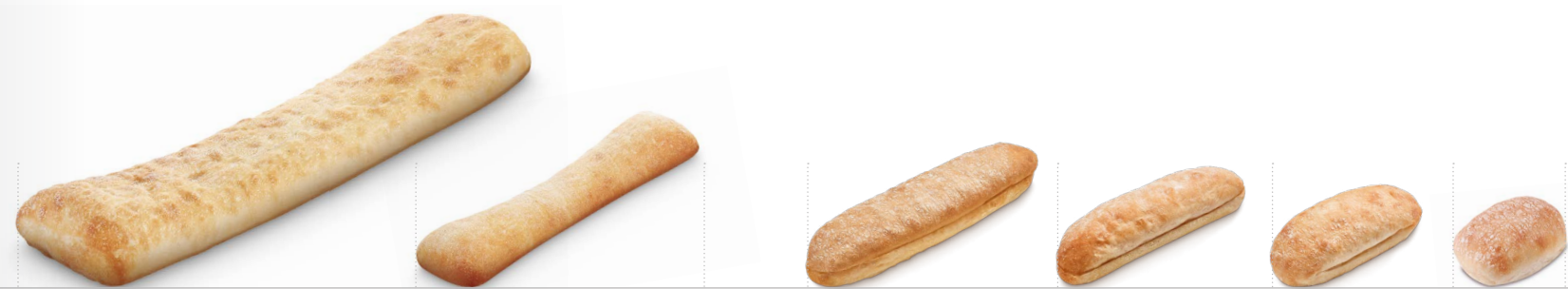
50 cm Cristallino Bread XL