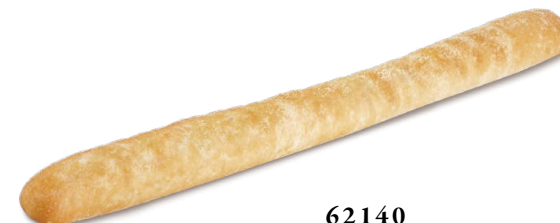
62140 CRISTALLINO FLUTE L

24 u | 100g | 4x14 | 20-30' °C 180-190° | 6-8' | 25 cm