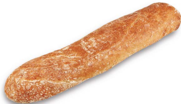
64970 GRAN CRISTALLINO SOURDOUGH XL 12 u | 330g | 4x8 40-50' | °C 180-200° 4-6' | 46 cm