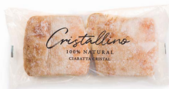
67322 CRISTALLINO CIABATTA* 28p x 2u | 190g | 4x8