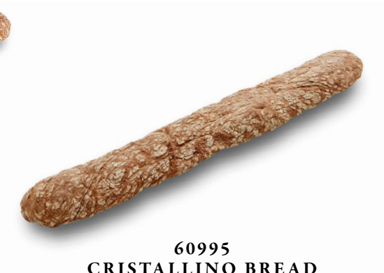
60995 CRISTALLINO BREAD 50% WHOLE GRAIN XL 8u | 380g | 4x14 15-20' | °C 180-200° 1-2' | 56,5 cm