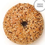
60985 CRISTALLINO CEREALS BAGEL (Precut)

60 u | 55 g | 4x8 20-40' | °C 180-190° 1' | 11,4 cm