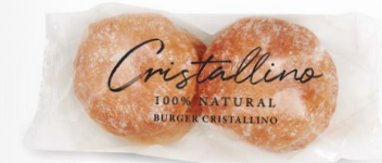
87476 CRISTALLINO BURGER BUN* 12x4u | 50g | 4x14 Packaging in english, french, italian, dutch & german