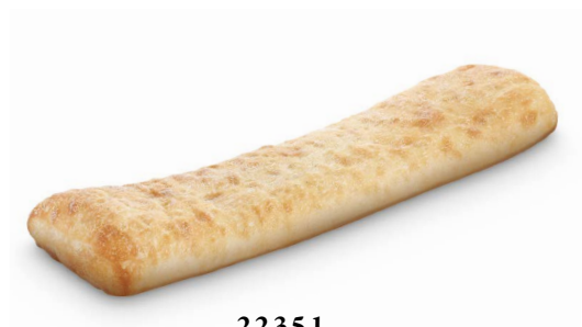
22351 CRISTALLINO BREAD XL

12 u | 325g | 4x7 | 30-45' °C 180-200° | 4-6' | 50 cm