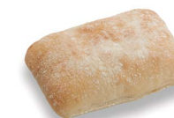
60781 CRISTALLINO PANINI

36 u | 105g | 4x8 20-30' | °C 180-190° 1-2' | 15 cm