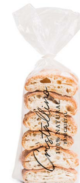
64969 BREAD CRISTALLINO 14p x 6u | 300g | 4x10