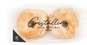
87473 CRISTALLINO BAGEL 14p x 4u | 55g | 4x8 Packaging in english, french, italian, dutch & german