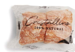
64979 CRISTALLINO 20bx4u | 200g | 4x11