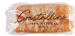
63446 CRISTALLINO SOURDOUGH 1/2 BAGUETTE* 16p x 2u | 81g | 4x14