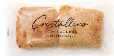
60032 CRISTALLINO BEER CIABATTA* 28p x 2u | 196g | 4x8