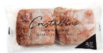
60031 CRISTALLINO CIABATTA 100% WHOLEGRAIN 28x2u | 190g | 4x14