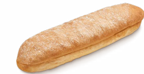
63441 CRISTALLINO SOURD 1/2 BAGUETTE (Precut)