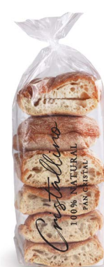
87477 SAINT HONORÉ CRISTALLINO 14p x 6u | 300g | 4x10 Packaging in english, french, italian, dutch & german