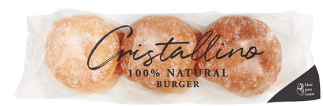
69865 CRISTALLINO SLICED* 10p x 6u | 71g | 4x8