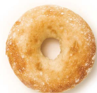
60875 BAGEL CRISTALLINO (Precut)

60 u | 55 g | 4x8 20-40' | °C 180-190° 1' | 11,4 cm