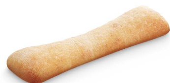
23350 SANDWICH CRISTALLINO BREAD M

12 u | 325g | 4x7 | 30-45' °C 180-200° | 4-6' | 50 cm