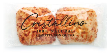
65405 CRISTALLINO GOUDA CIBATTA* 28p x 2u | 190g | 4x10