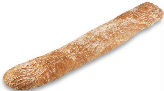
67932 CRISTALLINO BREAD XXL 12u | 470g | 4x6 45' | °C 180-200° 1-2' | 75 cm