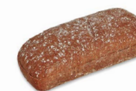
60780 PANINI CRISTALLINO 100% WHOLE GRAIN

36 u | 105g | 4x8 20-30' | °C 180-190° 1-2' | 15 cm