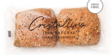
60036 CRISTALLINO KORNSPITZ CIABATTA* 28p x 2u | 186g | 4x8