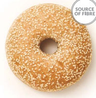
60895 SEMI-WHOLEGRAIN CRISTALLINO BAGEL (Precut)

60 u | 75 g | 4x8 20-40' | °C 180-190° 1' | 11 cm