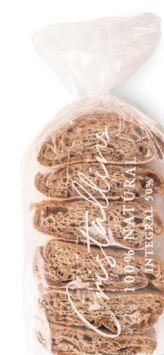
60996 CRISTALLINO 50% WHOLEGRAIN 14u | 285g | 4x11