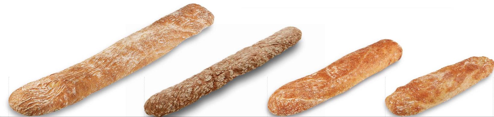
72 cm Cristallino Bread XXL