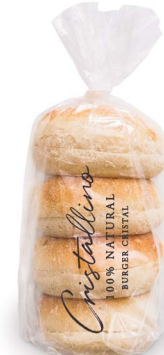
87341 BURGER CRISTALLINO 15b x 4u | 300g | 4x14 Packaging in English, Italian and French