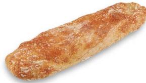
64974 CRISTALLINO BREAD L 12p x 2u | 330g/pack - 165g/u 4x7 | 45' | °C 180-200° 1-2' | 36 cm