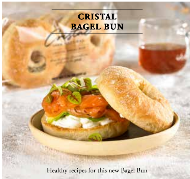
Healthy recipes for this new Bagel Bun