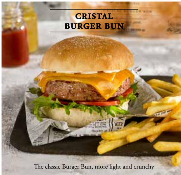
The classic Burger Bun, more light and crunchy