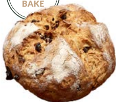
9510 Irish Soda Bread

25 pcs. 19.00 oz 10x15 8-12hr 340-350 30-35'