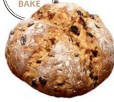
9514 Irish Soda Bread with Caraway Seeds

25 pcs. 19.00 oz 10x15 8-12hr 340-350 30-35'