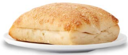
ASIAGO CHEESE RUSTICA® CIABATTA ROLLS