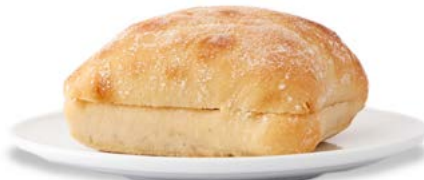
RUSTICA® CIABATTA ROLLS