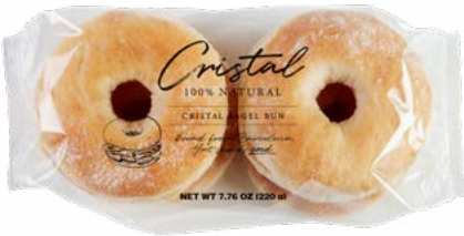
65478 Cristal Bagel Bun - 4 Count 15 packs x 4u | 1.94 oz 8x7 | 20-30' | 4.13 in