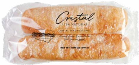
65474 Cristal Sandwich Roll - 4 Count 12 packs x 4u | 3.00 oz 8x6 | 20-30'