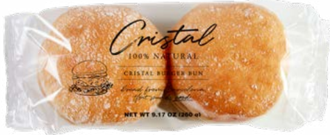
65847 Cristal Burger Bun - 4 Count 18 packs x 4u | 2.29 oz 8x7 | 20-30' | 4.13 in