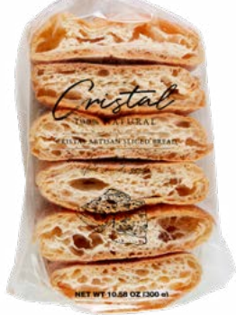
65412 Cristal Artisan Sliced Bread - 6 Count 15 packs x 6u | 1.76 oz 8x7 | 20-30'