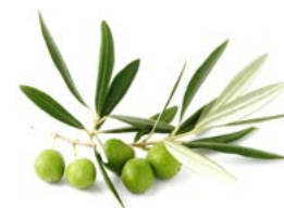
Made with olive oil