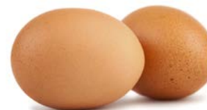
Cage free eggs