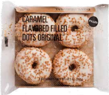
66581 Caramel Flavored Filled Dots Original® 24 bags of 4 | 10.30 oz 5x10 | 25-30'