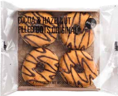
66578 Cocoa & Hazelnut Filled Dots Original® 24 bags of 4 | 10.58 oz 5x10 | 25-30'