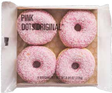
66576 Pink DotsOriginal® 24 bags of 4 | 8.04 oz 5x10 | 25-30'