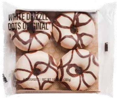
66577 White Drizzle DotsOriginal® 24 bags of 4 | 10.58 oz 5x10 | 25-30'