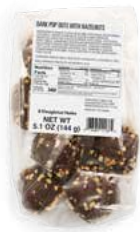
88258 Cocoa & Hazelnut Pop Dots Original® 8u 16 bags of 8 | 5.08 oz 10x11 | 15-20'