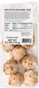
88256 White Caramel Flavored Pop Dots Original® 8u 16 bags of 8 | 6.21 oz 10x11 | 15-20'