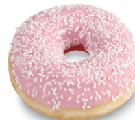
66576 PINK DOTSORIGINAL® 36 bags | 2.12oz | 10x15

NO PRESERVATIVES | NO ARTIFICIAL FLAVORS HYDROGENATED FAT FREE GMO FREE | RSPQ