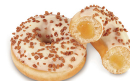
66851 CARAMEL FLAVORED FILLED DOTSORIGINAL® 24 bags | 10.58oz | 5x10

NO PRESERVATIVES | NO ARTIFICIAL FLAVORS HYDROGENATED FAT FREE GMO FREE | RSPQ