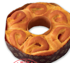
42655 | 22655 (no label) PASTRY CRÈME BRIOCHE RING 8u | 13oz | 10x9