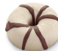
66577 WHITE DRIZZLE DOTSORIGINAL® 24 bags | 10.58oz | 5x10

NO PRESERVATIVES | NO ARTIFICIAL FLAVORS HYDROGENATED FAT FREE GMO FREE | RSPQ