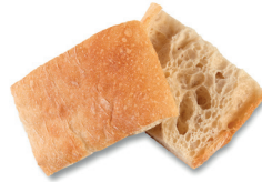
65412 CRISTAL ARTISAN SLICED BREAD 15 bags (6u) | 10.58oz | 8x7 | 4.92"

100% NATURAL | CLEAN LABEL MADE WITH SOURDOUGH OLIVE OIL | VEGAN | SLICED