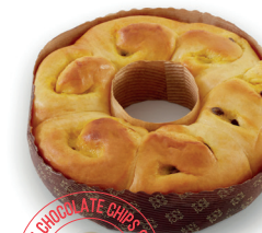
42617 | 22617 (no label) CHOCOLATE CHIPS & CRÈME BRIOCHE RING 8u | 13oz | 10x9