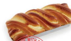
51075 | 51655 (no label) CRÈME CHEESE BRIOCHE SWIRL 16u | 14.11oz | 8x3 | 20-30" | 9.75"