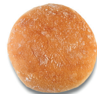
65847 CRISTAL BURGER BUN 18 bags (4u) | 9.17oz | 8x7 | 4.13"

100% NATURAL | CLEAN LABEL MADE WITH SOURDOUGH OLIVE OIL | VEGAN | SLICED