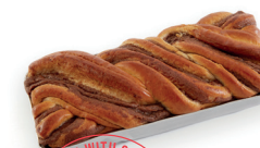
51457 | 51648 (no label) BRIOCHE CHOCOLATE SWIRL 16u | 14.11oz | 8x8 | 20-30"