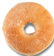
65478 CRISTAL BAGEL BUN 15 bags (4u) | 7.76oz | 8x7 | 4.49"

100% NATURAL | CLEAN LABEL MADE WITH SOURDOUGH OLIVE OIL | VEGAN | SLICED