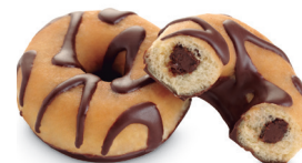
66578 COCOA & HAZELNUT FILLED DOTSORIGINAL® 24 bags | 10.58oz | 5x10

NO PRESERVATIVES | NO ARTIFICIAL FLAVORS HYDROGENATED FAT FREE GMO FREE | RSPQ