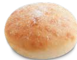
84964 LARGE CRISTAL BURGER BUN SLICED 60 u / 2.65 oz. / 4.57 ln 5x8 / 20' Thaw