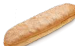
9,06" Cristal Sandwich Roll