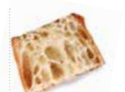
4,92" Cristal Artisan Sliced Bread (Retail Ready only)