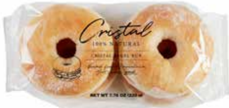
65478 CRISTAL BAGEL BUN 4 COUNT 15 packs x 4u / 1.94 oz. / 4.49 ln 8x7 / 20-30' Thaw