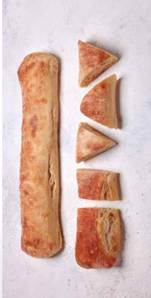
62140 CRISTAL FLUTE ROLLS 35 u / 5.11 oz. / 19,69 ln 5x9 / 20-30' Thaw