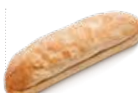
7,09" Cristal Roll