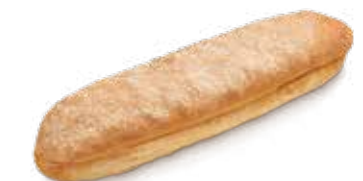
63441 CRISTAL SANDWICH ROLL SLICED 48 u / 3.00 oz. / 9.06 ln 5x18 / 20-30' Thaw