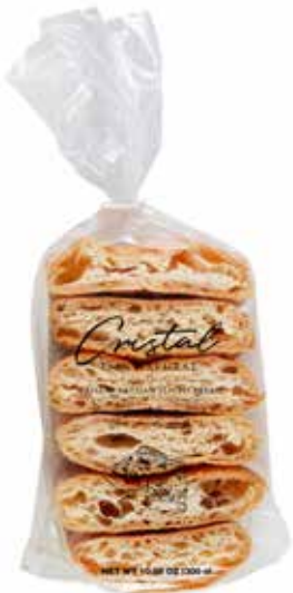
65412 CRISTAL ARTISAN SLICED BREAD 6 COUNT 15 packs x 6u / 1.76 oz. 4.92 ln / 8x7 / 20-30' Thaw