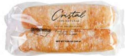
65474 CRISTAL SANDWICH ROLLS SLICED 4 COUNT 12 packs x 4u / 3.0 oz. 8.8 ln / 8x6 / 20-31' Thaw