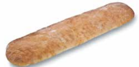
64970 CRISTAL ARTISAN BREAD 12 u / 11.64 oz. 18.11 ln / 5x8 / 30-40' Thaw