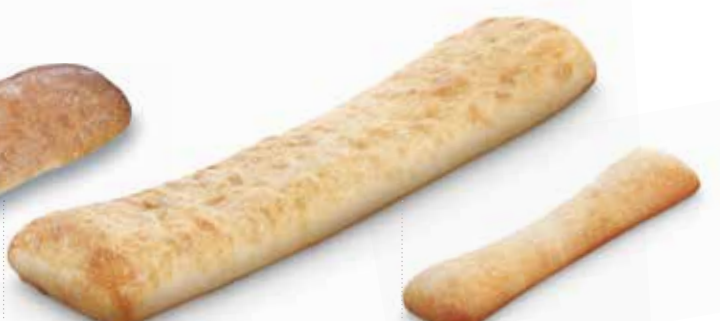
19,69" Cristal Long Ciabatta