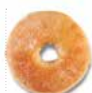
4,33" Cristal Bagel Bun