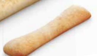
9,84" Cristal Sand Ciabatta