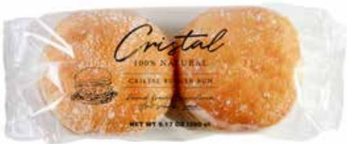
65847 CRISTAL BURGER BUN 4 COUNT 18 packs x 4u / 2.29 oz. 4.13 ln / 8x7 / 20-30' Thaw