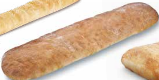
18,11" Cristal Artisan Bread