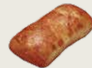
72041 RUSTICA® CIABATTA 3x7 SUB ROLLS SL 50U / 4.75oz. / 6x6 15-20 Thaw / 7 inch

The perfect range for the Foodservice channel. Presented in bulk boxes of more than 60 u. You can defrost it on demand.