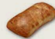
74741 RUSTICA® CIABATTA 3x7 SUB 50U / 4.8oz. / 6x6 20-30 Thaw / 7 inch