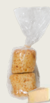
41119 ASIAGO CHEESE RUSTICA® CIABATTA 3X3 4 COUNT

16 bags x 4 / 3.0 oz. / 10x7 20-30 Thaw / 4 inch