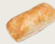
73524 ONION POPPY RUSTICA® CIABATTA SUB 3x6 80U / 3.5oz. / 5x8 15-20 Thaw / 6 inch