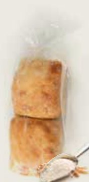
41113 RUSTICA® CIABATTA SL SANDWICH ROLLS 4 COUNT

The perfect format for the Foodservice channel. Presented in bulk boxes of more than 60 u.