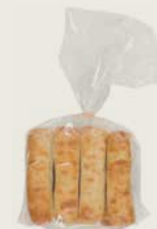
42466 SAUSAGE RUSTICA® SL BUNS 8 COUNT

10 bags x 8 / 3.5 oz. / 5x8 20-30 Thaw / 3x6 inch