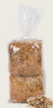
41117 MULTIGRAIN RUSTICA® CIABATTA SL SANDWICH ROLLS 4 COUNT

16 bags x 4 / 3.0 oz. / 10x7 20-30 Thaw / 4 inch