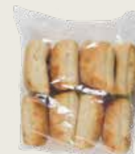
63035 RUSTICA® CIABATTA 4x4 SANDWICH SL 8 COUNT

18 bags x 4 / 1.8 oz. / 10x7 20-30 Thaw / 4 inch