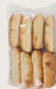
63535 RUSTICA® CIABATTA 3x6 SANDWICH SL 8 COUNT

9 bags x 8 / 3.0 oz. / 6x6 20-30 Thaw / 4 inch