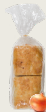
41111 ONION POPPY RUSTICA® CIABATTA SL SANDWICH ROLLS 4 COUNT

16 bags x 4 / 3.0 oz. / 10x7 20-30 Thaw / 4 inch