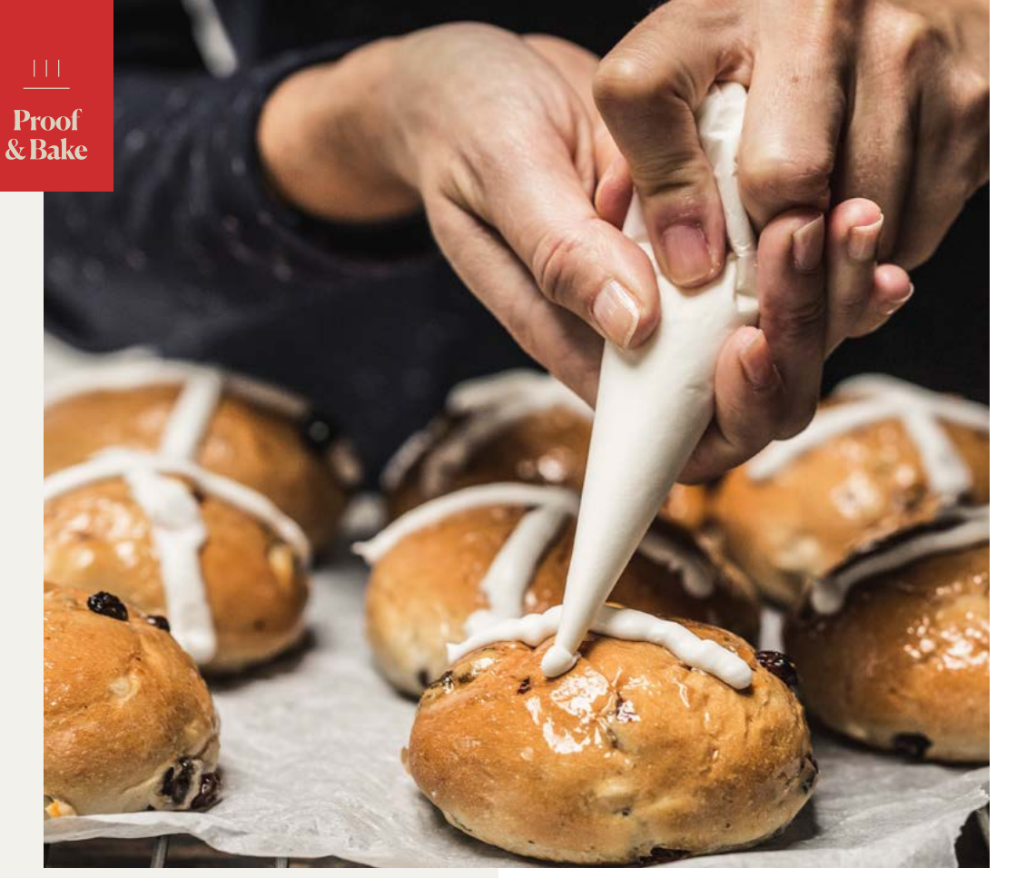
Hot Cross Buns

The traditional Lenten treat! made with currants or raisins and raised with yeast.