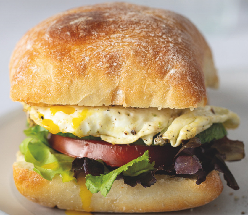
→ Fried Egg, Bacon, Tomato & Lettuce ←