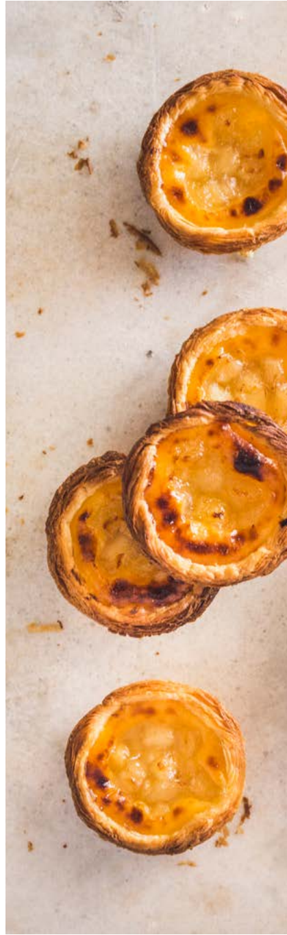
Pastel de Nata