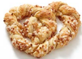
40287 Apple & Cinnamon Bretzel 32 u / 5.53 oz / 10x12 / 45-50' Thaw 375° / 19-20' Oven