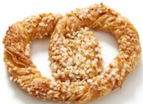
20280 Custard Flavored & Almond Bretzel Pastry 32 u / 5.26 oz / 10x12 / 45-50' Thaw 375° / 19-20' Oven