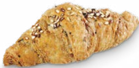
22180 Butter Multi-grain Croissant 55 u / 2.8 oz / 8X9 / 20-30' Thaw 360° / 15-20' Oven / 5.71 in. Clean Label / 100% Natural / Made with Butter No preservatives / Vegetarian / GMO Free