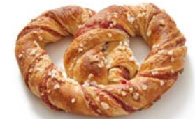
42531 Raspberry Bretzel 32 u / 4.41 oz / 10x14 / 45-50' Thaw 375° / 19-20' Oven Clean Label