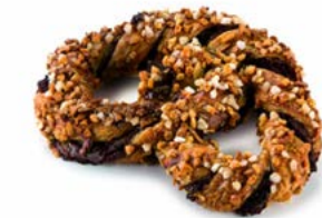
90131 Chocolate & Almond Bretzel Pastry 32 u / 5.26 oz / 10x14 / 45-50' Thaw 375° / 19-20' Oven Clean Label