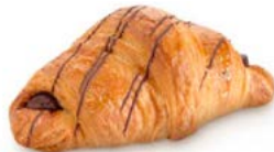
69281 Chocolate Croissant 50 u / 5.55 oz / 10X9 / 15-30' Thaw. 320-355° / 15-20' Oven / 4.65 in. Made with Margarine / No preservatives Hydrogenated Fat Free