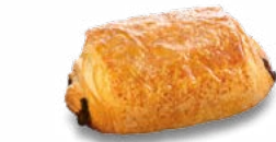
22175 Pain Au Chocolat Croissant 80 u / 2.5 oz / 8X9 / 20-30' Thaw 350-360° / 15' Oven / 5.14 in. Made with Butter / No preservatives Vegetarian / Kosher OU-D