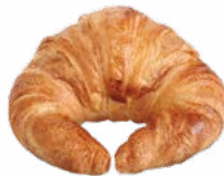
90125 Margarine Curved Croissant 54 u / 5.4 oz / 10x9 / 20-30' Thaw. 340-360° / 15-20' Oven / 4.56 in. Made with Margarine / GMO Free