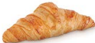
29231 Paris Butter Croissant 125 u / 2.1 oz / 10x15 / 20-30' Thaw 338-355° / 15-18' Horno / 5.71 in. Clean Label / 100% Natural / Made with Butter No preservatives / Vegetarian / GMO Free