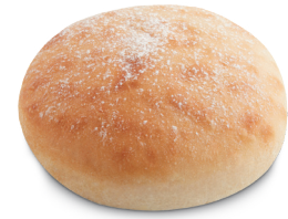
84964 LARGE CRISTAL BURGER BUN SLICED 60 u / 2.65 oz. / 5x8 20-30' Thaw / 4.57 In.