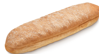
63441 CRISTAL SANDWICH ROLL SLICED 48 u / 3.00 oz. / 5x11 40-50' Thaw / 9.1 In.