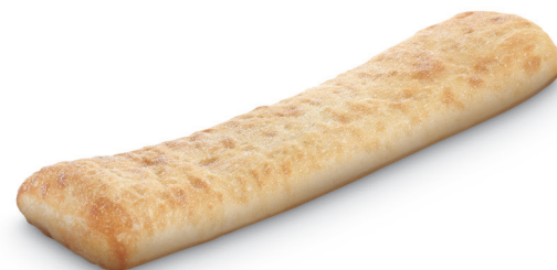
82251 LONG CIABATTA CRISTAL BREAD 12 u / 13.76 oz. / 5x7 15-20' Thaw / 19.69 In.