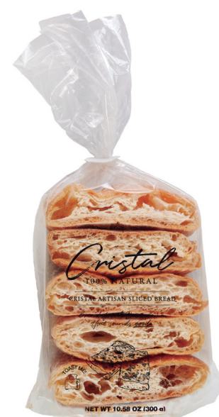
65847 CRISTAL ARTISAN SLICED BREAD 115 pcs (23 packs of 5) 8x6 / 20-30' Thaw / 4.92 in.