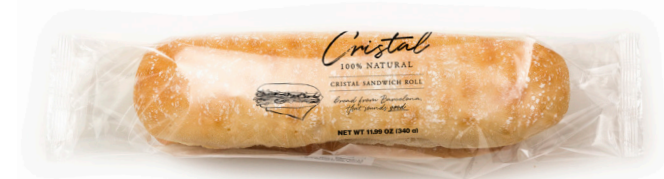
83769 CRISTAL SANDWICH ROLL 48 pcs (24 packs of 2) / 11.99 oz 8x6 / 20-30' Thaw / 4.33 in

Illustration by Santi Salles (Barcelona)