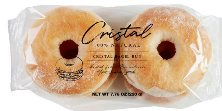
65478 CRISTAL BAGEL BUN 4 COUNT 60 pcs (15 packs of 4) / 1.94 oz 8x7 / 20-30' Thaw / 4.33 in