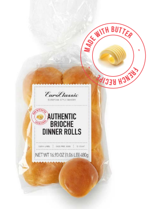
51563 / 21563 (no label) Authentic Brioche Dinner Rolls 14 bags of 12 / 16.93 oz / 5x8 20-30' Thaw / 2.75 in. Clean Label / Sliced Cage-Free Eggs / Buttery