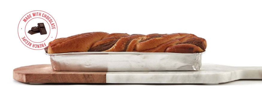
51457 / 51648 (no label) Chocolate Brioche Swirl 16 u. / 14.11 oz / 8x8 20-30' Thaw Clean Label / Butter Cage-Free Eggs