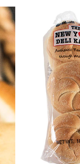
91698 New York Deli Kaiser Rolls 10 bags of 6 / 18 oz / 5x8 20-30' Thaw / 4.5 in. Kosher