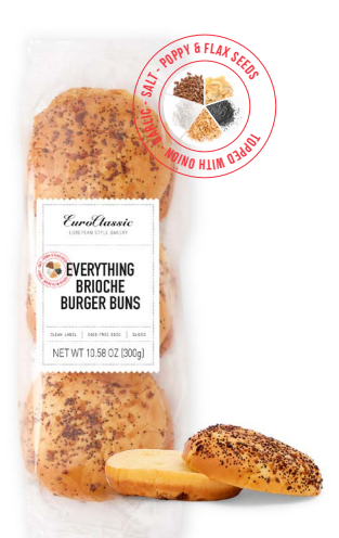
47464 / 27464 (no label) Everything Brioche Burger Buns 14 bags / 10.58 oz / 5x11 20-30' Thaw / 4 in. Clean Label / Sliced Cage-Free Eggs / Buttery