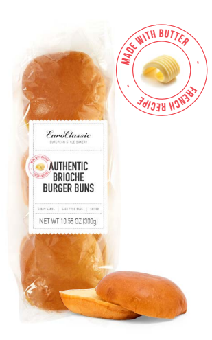
41464 / 21464 (no label) Authentic Brioche Burger Buns 14 bags / 10.58 oz / 5x11 20-30' Thaw / 4 in. Clean Label / Buttery Cage-Free Eggs / Sliced