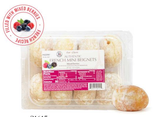
21615 Mixed Berry Mini Beignets (Filled) 128 u. (16 packs of 8 u) 7.05 oz / 10x9 / 20-30' Thaw Clean Label / Butter French Recipe