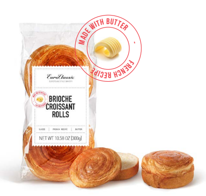
44912 / 24912 (no label) Brioche Croissant Rolls 24 bags of 4 / 10.58 oz / 5x10 20-30' Thaw Sliced / Buttery