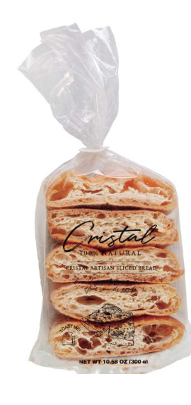
65847 Cristal Artisan SlicedBread 115 pcs (23 packs of 5) 8x6 / 20-30' Thaw / 4.92 in. Sliced