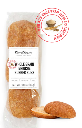
S1433 / 21433 (no label) Whole Grain Brioche Burger Buns 14 bags / 10.58 oz / 5x11 20-30' Thaw / 4 in. Clean Label / Sliced Cage-Free Eggs / Buttery