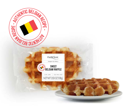
51591 / 21591 (No label) Sweet Belgian Waffle 24 u. / 3.53 oz 10x16 / 20-30' Thaw Clean Label / Cage Free Eggs