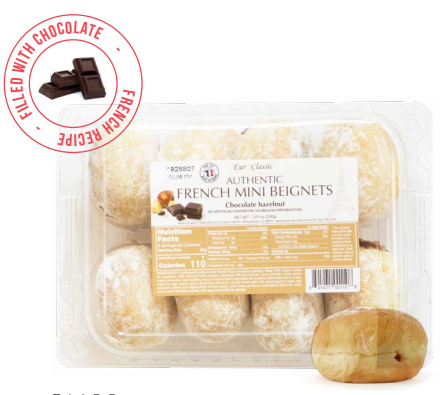
21608 Chocolate Mini Beignets (Filled) 128 u. (16 packs of 8 u) 7.05 oz / 10x9 / 20-30' Thaw Clean Label / Butter French Recipe