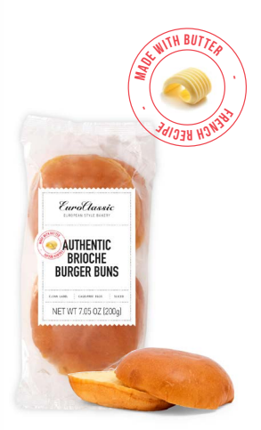
88144 Authentic Brioche Burger Buns 18 bags / 7.05 oz / 5x11 20-30' Thaw / 4 in. Clean Label Cage-Free Eggs / Sliced