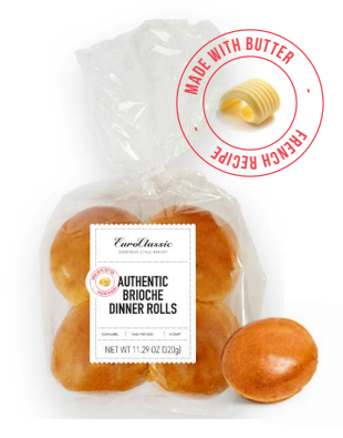
58563 Authentic Brioche Dinner Rolls 16 bags of 8 / 11.29 oz / 5x11 5-10' Thaw / 2 in. Clean Label Cage-Free Eggs / Buttery