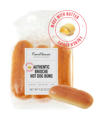
51495 / 21495 (no label) Authentic Brioche Hot Dog Buns 17 bags of 6 / 9.52 oz / 5x11 20-30' Thaw / 6 in. Clean Label / Sliced Cage-Free Eggs / Buttery