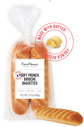
50030 / 20033 (no label) Soft French Brioche Baguette 14 bags of 4 / 12 oz / 5xll 20-30' Thaw / 9 in. Clean Label / Sliced Cage-Free Eggs / Buttery