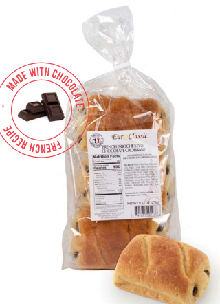
51235 Brioche Styke Chocolate Croissant 54pcs / 9 packs of 6 / 9.52oz 5x24 / 20-30' Thaw / 3 in. Clean Label / Butter French Recipe