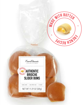
58244 Authentic Brioche Slider Buns 16 bags of 8 / 11.29 oz / 5x11 5-10' Thaw / 2 in. Clean Label / Buttery Sliced