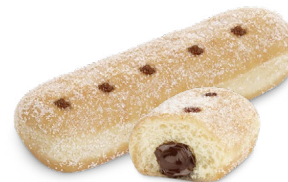
62810 COCOA & HAZELNUT FILLED LONGDOTS ORIGINAL®

THESE ARE PLAIN, SOFT DOUGHNUTS IDEAL FOR CUSTOMIZING WITH YOUR OWN IDEAS FOR FILLINGS AND TOPPINGS.