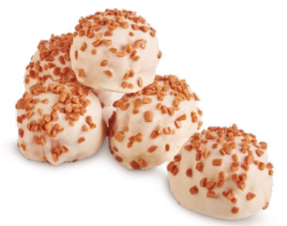
64235 WHITE CARAMEL FLAVORED POPDOTS ORIGINAL® 88 U | 0.78 OZ | 10 X16 | 15-20' THESE POPDOTS ORIGINAL® ARE TRULY AN EYE-CATCHER WITH ITS LAYER OF WHITE ICING AND CRUNCHY CARAMEL FLAVORED TOPPING.