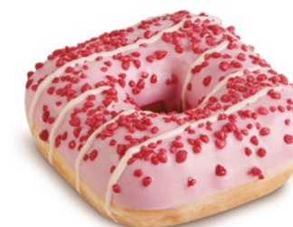
60115 PINK SQUARE DOTS ORIGINAL®

36 U | 2.10Z | 10 X13 | 15-20' CHEESECAKE-FLAVORED COATING TOPPED WITH CHOCOLATE COOKIE CRUMBLES.