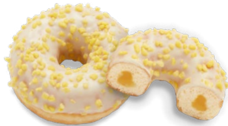
81145 LEMON FILLED DOTS ORIGINAL®

FILLED WITH A SMOOTH WHITE ALMOND CREAM AND TOPPED WITH A WHITE ICING AND A GENEROUS LAYER OF SHREDDED COCONUT.