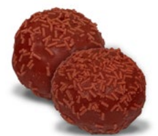
84392 MIXED BERRIES FILLED POPDOTS ORIGINAL® 80 U | 0.905 OZ | 10 X17 | 30-40' FUN & FLAVORFUL MIXED BERRIES POP DOTS ORIGINAL® HAS A SOFT CENTER WITH A SWEET BERRY FILLING THAT MAKES THEM IRRESISTIBLE.