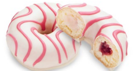
67439 RASPBERRY & CHEESECAKE FILLED DOTS ORIGINAL®