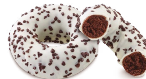
64920 DOTS ORIGINAL® ON THE ROCKS

36 U | 1.94 OZ | 10 X15 | 15-20' DECORATED WITH A LAYER OF DARK COCOA FLAVORED COATING AND PASTEL-COLORED SPRINKLES ON TOP.