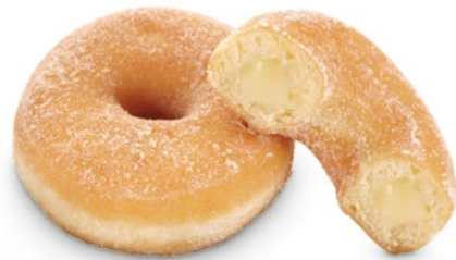
61293 CUSTARD FLAVORED FILLED SUGARED DOTS ORIGINAL®