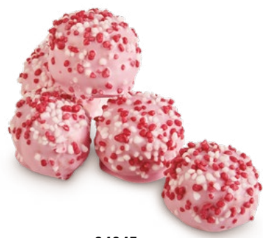
64245 PINK POPDOTS ORIGINAL® 88 U | 0.74 OZ | 10 X16 | 15-20' THEIR ATTRACTIVE COATING, WITH STRAWBERRY AND CREAM-FLAVORED SPRINKLES, IS IRRESISTIBLE.