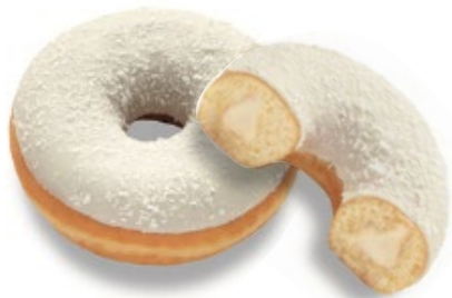
65144 COCONUT AND ALMOND DOTS ORIGINAL®

SOFT DOUGH, CUSTARD-FLAVORED CREAM, TOPPED WITH REAL GRANULATED SUGAR.