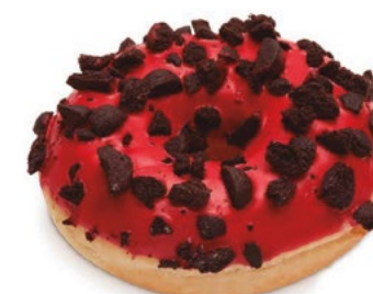
61175 RED COOKIE CRUMBLES DOTS ORIGINAL®

36 U | 2.12 OZ | 10 X15 | 15-20' DELICATE STRAWBERRY-FLAVORED GLAZE WITH WHITE SPRINKLES.