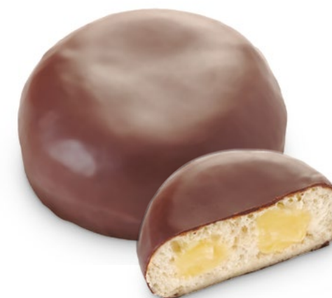
64190 CUSTARD & COCOA BALLDOTS ORIGINAL®

A DELICIOUS FILLED DONUT COATED WITH SWEET GRANULATED SUGAR AND FILLED WITH AN IRRESISTIBLE RASPBERRY JELLY.