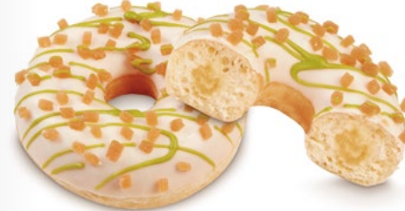
68765 APPLE FILLED DOTS ORIGINAL®

WITH A CREAMY CARAMEL-FLAVORED FILLING. THE WHITE ICING ON TOP IS HIGHLIGHTED WITH A CRUNCHY CARAMEL-FLAVORED TOPPING.