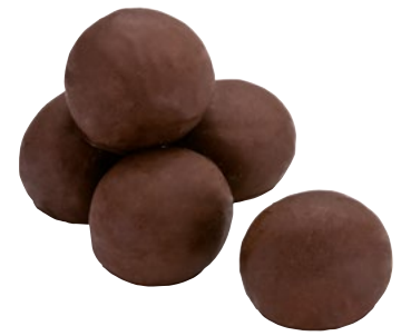
64220 COCOA POPDOTS ORIGINAL® 100 U | 0.56 OZ | 10 X16 | 15-20' SOFT, SPONGY POPDOTS ORIGINAL® COATED WITH COCOA.