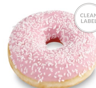
80668 PINK DOTS ORIGINAL®

36 U | 1.98 OZ | 10 X15 | 15-20' DIPPED IN WHITE ICING AND TOPPED WITH PASTEL-COLORED SUGAR SPRINKLES.