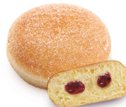
90159 JELLY FILLED BALLDOTS ORIGINAL®

SOFT DOUGH IN LONG FORMAT, FILLED WITH COCOA HAZELNUT CREAM, AND TOPPED WITH REAL GRANULATED SUGAR.