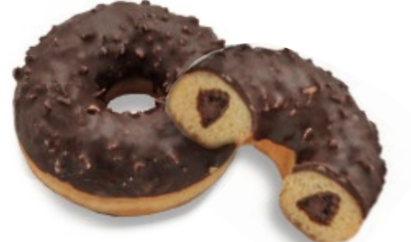
65164 COCOA CRUNCH FILLED DOTS ORIGINAL®

YOGURT CREAM FILLED, COVERED WITH WHITE ICING AND TOPPED WITH RED VELVET COOKIE BITS.