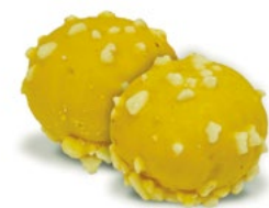
84391 LEMON FILLED POPDOTS ORIGINAL® 80 U | 0.935 OZ | 10 X17 | 30-40' MEET OUR SPECIAL FILLED LEMON POP DOTS ORIGINAL® WITH A BRIGHT, COLORFUL COATING BURSTING WITH ZESTY LEMON IN EVERY BITE. IT IS SURE TO AWAKEN YOUR SENSES.