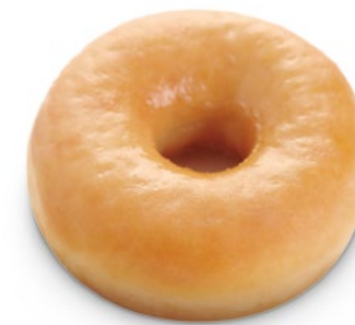
85591 LARGE GLAZED DOTS ORIGINAL ® 48 U | 2.47 OZ | 5 x 15 | 15-20' THE CLASSIC WITH A SUGAR GLAZE ON TOP, LARGE SIZE.