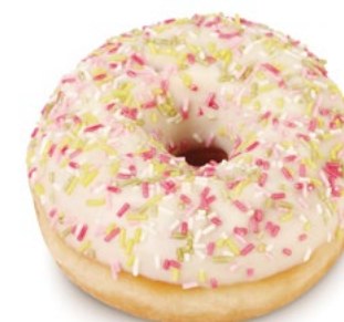
24260 CONFETTI DOTS ORIGINAL®

36 U | 3.10 OZ | 10 X15 | 15-20' EXQUISITE COCOA-LADEN CAKE DOUGH, COATED IN WHITE ICING AND TOPPED ALL AROUND WITH COCOA FLAVORED BITS.