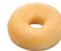
39880 PLAIN MINI DOTS ORIGINAL ® 65 U | 0.78 OZ | 10 x 11 | 10-15' OUR CLASSIC DOTS, MADE BITE-SIZED! SOFT DOUGH WITH NO DECORATIONS, MAKING IT IDEAL FOR CUSTOMIZATIONS.