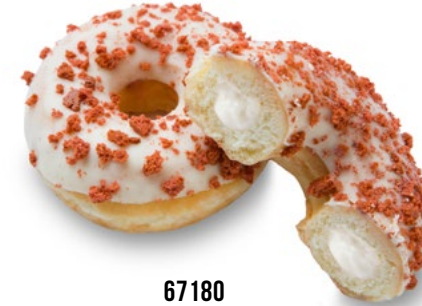
67180 RED VELVET DOTS ORIGINAL®

FILLED WITH APPLE JAM AND HAVE A WHITE ICING COATING, TOPPED WITH SMALL PIECES OF JELLY APPLE BITS!