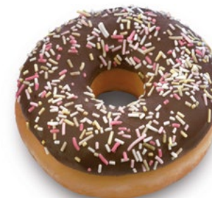
83084 SPRINKLED COCOA DOTS ORIGINAL®

36 U | 1.94 OZ | 10 X15 | 15-20' DECORATED WITH A LAYER OF DARK COCOA FLAVORED COATING AND PASTEL-COLORED SPRINKLES ON TOP.