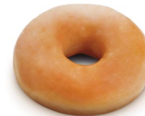
65520 PLAIN DOTS ORIGINAL ® 72 U | 1.55 OZ | 5 x 15 | 15-20' ARTISANAL APPEARANCE, UNCOATED AND UNFILLED, SO YOU CAN PERSONALIZE DECORATION AND FILLING AS YOU LIKE IT.