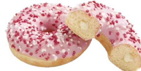
67124 PINK & WHITE FILLED DOTS ORIGINAL®