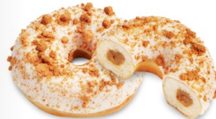
65401 LOTUS BISCOFF® FILLED DOTS ORIGINAL®

FILLED WITH TASTY COCOA & HAZELNUT CREAM AND COVERED WITH A CRUNCHY SPRINKLING OF COOKIE PIECES AND TOASTED HAZELNUT.