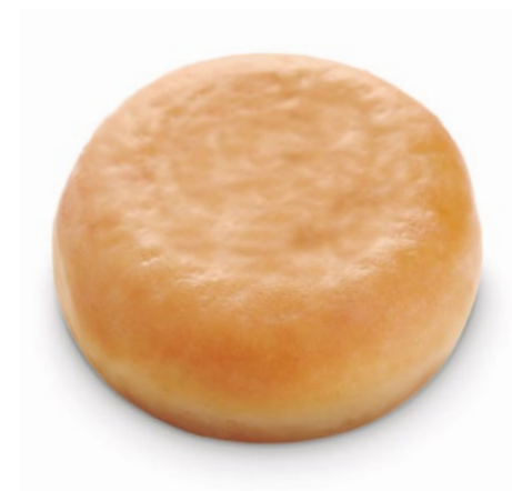
35890 PLAIN BALLDOTS ORIGINAL®