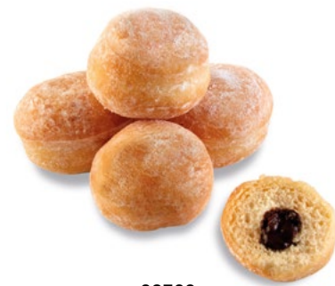
68739 POWDERED COCOA FILLED POPDOTS ORIGINAL® 108 U | 0.64 OZ | 10 X15 | 15-20' OUR NEW POPDOTS ORIGINAL® HAS A CREAMY CHOCOLATE INTERIOR AND FLUFFY DOUGH DECORATED WITH ICING SUGAR.