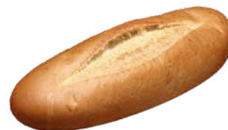
6760 Italian Bread 32 pcs / 14 oz 10x6 / 8-12h Thaw 35-40' Proof / 400 °F 20-25' Oven / 12 in.