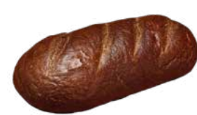
7044 Pumpernickel Bread - CL 30 pcs / 19 oz / 10x5 8-12h Thaw / 30-40' Proof 375-385°F / 30-35' Oven / 8 in. Clean Label