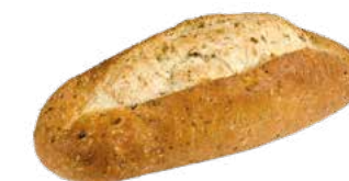
7843 Short 5-Grain Italian Bread-CL 24 pcs / 19 oz / 10x6 8-12h Thaw / 30-40' Proof 400 °F / 25-30' Oven / 10 in. Clean Label