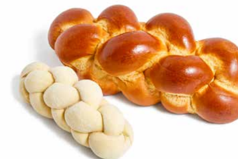
6677 4 Braid Challah 24 u / 18.5 oz / 10x6 / 30-35' Proof 8-12h Thaw / 320-325°F / 30-35' Oven Kosher