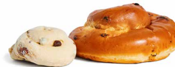
750 Round Challah With Raisins 7750 Round Challah With Raisins - CL 30 u / 19 oz / 10x5 / 30-35' Proof 8-12h Thaw / 320-325°F / 35-40' Oven Kosher / Clean Label