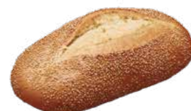
658 Vienna Sandwich Bread 30 pcs / 19 oz / 10x5 8-12h Thaw / 30-35' Proof 400°F / 25-30' Oven / 8 in.