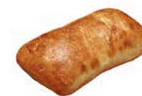
74741 Rustica® Sub Roll Ciabatta 3x7 50 pcs / 4.75 oz / 6x6 20-30' Thaw / 7 in. Olive Oil / Vegan Sliced / No Artificial Colors or Flavors No Preservatives Clean Label