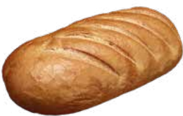
779 Plain Rye 2 Lb. 15 pcs / 38 oz / 10x5 8-12h Thaw / 30-40' Proof 375-385°F / 40-45' Oven / 12 in. Vegan / No preservatives