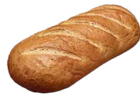
778 Seeded Rye 2 Lb. 15 pcs / 38 oz / 10x5 8-12h Thaw / 30-40' Proof 375-385°F / 40-45' Oven / 12 in. Vegan