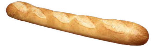
51801 French Parisian Large 15 pcs / 18.5 oz / 6x6 15-20' Thaw / 400-425 °F 8-10' Oven / 24 in. Vegan / No Artificial Colors or Flavors