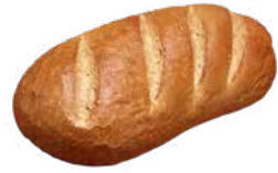
7379 More Robust Plain Rye Bread 30 pcs / 19 oz / 10x5 8-12h Thaw / 30-40' Proof 375-385°F / 30-35' Oven / 8 in. Vegan / No preservatives