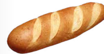
720 Medium Italian Bread 50 pcs / 10 oz / 10x5 8-12h Thaw / 35-40' Proof 400 °F / 20-25' Oven / 12 in.