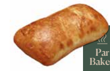
72041 Rustica® Ciabatta 5x7 SL 50 pcs / 4.75 oz / 6x6 15-20' Thaw / 425 °F 5' Oven / 7 in. Olive Oil / Vegan Sliced / No Artificial Colors or Flavors No Preservatives Clean Label