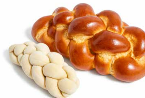
777 Braided Challah 7177 Braided Challah Bread - CL 30 u / 19 oz / 10x5 / 30-35' Proof 8-12h Thaw / 320-325°F / 35-40' Oven Kosher / Clean Label