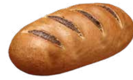
7390 More Robust Combo Rye Bread 30 pcs / 19 oz / 10x5 8-12h Thaw / 30-40' Proof 375-385°F / 30-35' Oven / 8 in.