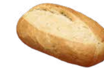
83701 6" Par-baked Sub

72 pcs / 4 oz / 5x8 15-20' Thaw / 400-425°F 5-7' Oven / 6 in. Vegan / Kosher Clean Label / No Artificial Colors, Flavors or Preservatives