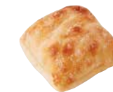
73046 Gourmet Rustica® Ciabatta 4x4 SL 72 pcs / 3 oz / 6x6 20-30' Thaw / 5 in. Olive Oil / Vegan Sliced / No Artificial Colors or Flavors No Preservatives Clean Label