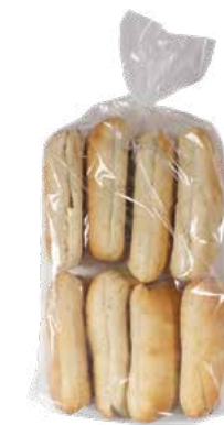
73524 Rustica® Ciabatta 3x6 Onion Poppy Sub SL 80 pcs / 28 oz 5x8 / 20-30' Thaw / 6 in. Sliced / No Artificial Flavors No Artificial Colors