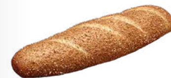
7869 10 Oz. Wheat Italian Bread-CL 50 pcs / 10 oz / 10x5 8-12h Thaw / 35-40' Proof 400 °F / 18-21' Oven / 12 in. Vegan / Clean Label