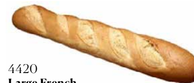
4420 Large French Bread

15 pcs / 18.5 oz / 6x6 15-20' Thaw / 400-425 °F 8-10' Oven / 24 in. Kosher / Vegan / No Artificial Colors or Flavors