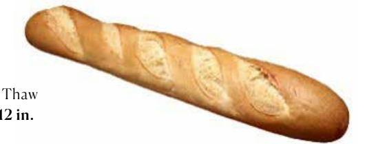
4420 Large French Bread 30 pcs / 19 oz / 10x5 / 8-12h Thaw 375-385 °F / 25-30' Oven / 12 in. No Artificial Colors, Flavors or Preservatives