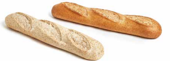
39905 9oz. Honey Wheat Bread 42 pcs / 9.5 oz / 5x7 15-20' Thaw / 400-425 °F 10-12' Oven / 14.25 in. No Artificial Colors, Flavors or Preservatives