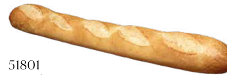
51801 French Parisian Large

15 pcs / 18.5 oz / 6x6 15-20' Thaw / 400-425 °F 8-10' Oven / 24 in. Kosher / Vegan / No Artificial Colors or Flavors