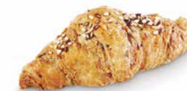
23721 Mini Butter Multigrain Croissant 140 u / 0.88 oz / 10x12 10' Thaw / 360-370°F 10-12' Oven / 5.54 in. Made with Butter / Kosher No Preservatives / Vegetarian No artificial Colors or Flavor