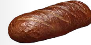
780 Plain Pumpernickel 2 Lb. 15 pcs / 38 oz / 10x5 8-12h Thaw / 0-40' Proof 375-385°F / 40-45' Oven / 12 in. Vegan