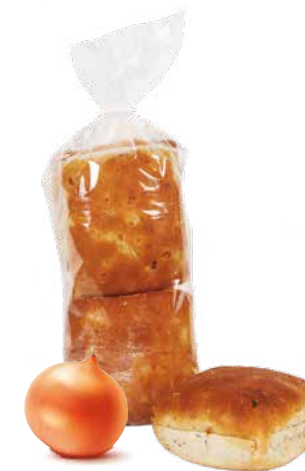
41111 Onion Poppy Ciabatta SL 64 pcs (16 bags of 4) / 12 oz 10x7 / 20-30' Thaw / 4 in. Vegan / Kosher