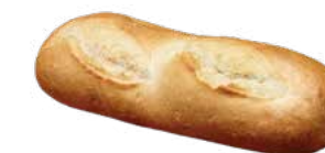
96501 9" Par-baked Sub

48 pcs / 5 oz / 6x6 20-30' Thaw / 400-425°F 5' Oven / 8 in. Kosher / Clean Label