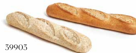
39903 9oz. Honey Wheat Bread

30 pcs / 19 oz / 10x5 / 8-12h Thaw 375-385 °F / 25-30' Oven / 12 in. No Artificial Flavors or Preservatives