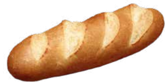
874-7874 CL 9 Oz. Italian Bread 60 pcs / 9 oz / 10x5 8-12h Thaw / 35-40' Proof 400 °F / 18-21' Oven / 12 in. No Artificial Colors, Flavors or Preservatives