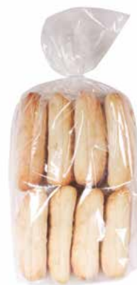
63535 Rustica® Ciabatta 3x6 Sandwich Sliced 8 count 80 pcs (10 bags of 8) / 28 oz 5x8 / 20-30' Thaw / 3x6 in.