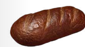
7381 More Robust Pumpernickel Bread 30 pcs / 19 oz / 10x5 8-12h Thaw / 30-40' Proof 375-385°F / 30-35' Oven / 8 in. Vegan