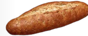
864 9 Oz. Five Grain Italian Bread 60 pcs / 9 oz / 10x5 8-12h Thaw / 35-40' Proof 400 °F / 18-22' Oven / 12 in.