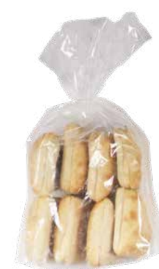
63035 Rustica® Ciabatta 4x4 Sandwich Sliced 8 count 72 pcs / 24 oz 6x6 / 20-30' Thaw / 4x4 in.