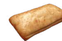
64246 Gourmet Ciabatta Sub Roll 3x7 SL 55 pcs / 4.25 oz / 6x6 20-30' Thaw / 7 in. Vegan / Sliced No Artificial Colors or Flavors No Preservatives