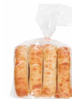
42466 Rustica® Sliced Sausage Buns 96 pcs (12 bags of 8) / 18 oz 5x10 / 20-30' Thaw / 6 in.