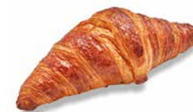
61685 Croissant Sophie 50 u / 2.46 oz / 8 x 9 30' Thaw / 330-360°F 18' Oven / 5.11 in. Made with Butter / Kosher