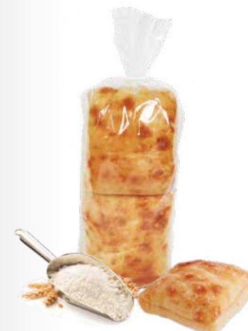
41113 Plain Ciabatta SL 64 pcs (16 bags of 4) / 12 oz 10x7 / 20-30' Thaw / 4 in. Vegan / Kosher