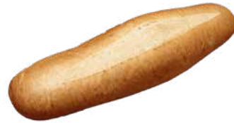
719 Small Italian 60 pcs / 8 oz / 10x5 8-12h Thaw / 35-40' Proof 400 °F / 15-20' Oven / 12 in.