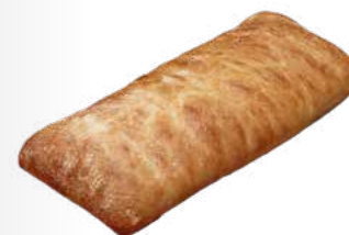
71241 Rustica® Ciabatta 12x5 20 pcs / 12 oz / 5x7 15-20' Thaw / 12 in. Olive Oil / Vegan Sliced / No Artificial Colors or Flavors No Preservatives Clean Label