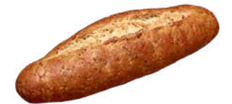
7850 Five Grain Italian Bread 30 pcs / 19 oz / 10x5 8-12h Thaw / 30-40' Proof 335 - 350 °F / 35-40' Oven / 8 in. Vegan / No Artificial Flavors