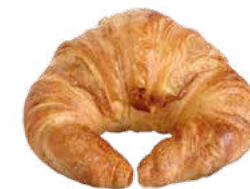
90127 Large Curved Croissant 40 u / 3.55 oz / 10x9 20-50' Thaw / 340-360°F 15-20' Oven Vegetarian / RSPO No Artificial