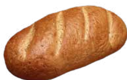
7378 More Robust Seeded Rye Bread 30 pcs / 19 oz / 10x5 8-12h Thaw / 30-40' Proof 375-385°F / 30-35' Oven / 8 in.