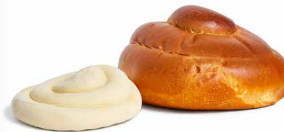
747 Round Challah 7747 Round Challah Bread - CL 30 u / 19 oz / 10x5 / 30-35' Proof 8-12h Thaw / 320-325°F / 35-40' Oven Kosher / Clean Label