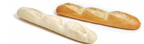
39901 9oz. French Bread 42 pcs / 9 oz / 5x7 15-20' Thaw / 400-425 °F 5-7' Oven / 9.5 in. Clean Label