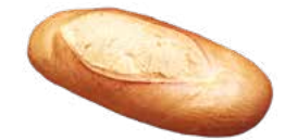
91801 Italian Bread

12 pcs / 18 oz / 5x7 20-30' Thaw / 400-425 °F 5' Oven / 12.25 in. Kosher / Vegan