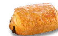
22175 Pain Au Chocolat Butter 80 u / 2.47 oz / 10x9 30' Thaw / 350-360°F 15' Oven / 5.14 in. Made with Butter No Preservatives Vegetarian / Kosher OU-D