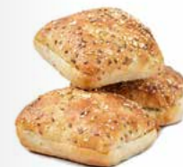
51048 Seeded Multigrain Ciabatta Roll 44 pcs / 3 oz 10x7 20-30' Thaw / 4 in. Olive Oil / Vegan Sliced / No Artificial Colors or Flavors No Preservatives Clean Label