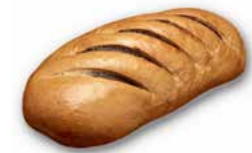
790 Combo Rye 2 lb. 15 pcs / 38 oz / 10x5 8-12h Thaw / 30-40' Proof 375-385°F / 40-45' Oven / 12 in.