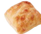
74041 Rustica® Ciabatta 4x4 60 pcs / 3.5 oz / 6x6 20-30' Thaw / 4 in. Olive Oil / Vegan Sliced / No Artificial Colors or Flavors No Preservatives Clean Label