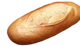
721 - 6721* Large Italian Bread 30 - *24 pcs / 19 oz 10x5 - *10x6 / 8-12h Thaw 30-40' Proof / 400 °F 25-30' Oven / 12 in.