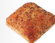
72912 Multigrain Rustica® Ciabatta 4x4 SL 72 pcs 3 oz 6x6 20-30' Thaw / 4 in. Olive Oil / Vegan Sliced / No Artificial Colors or Flavors No Preservatives Clean Label