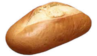
400 Large Short Italian Bread 30 pcs / 19 oz / 10x5 8-12h Thaw / 30-35' Proof 400 °F / 25-30' Oven / 10 in.