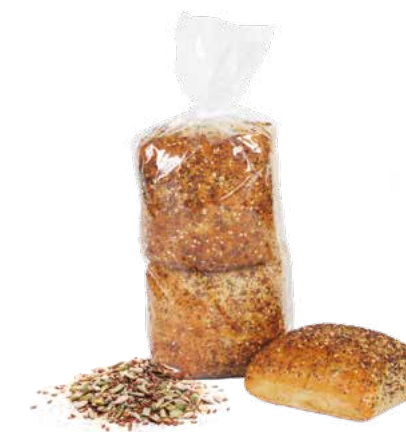
41117 Multigrain Rustica® Ciabatta 64 pcs (16 bags of 4) / 12 oz 10x7 / 20-30' Thaw / 4 in. Vegan / Kosher