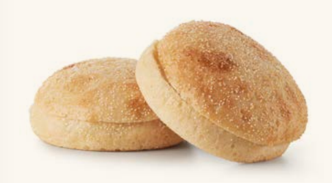
69897 CRISTAL BEER BURGER BUN 60 u / 2.82 oz / 5x8 / 20-30' Thaw / 4.40 In Vegan