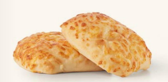
69719* CRISTAL GOUDA CHEESE BUN 28 u / 3.35 oz / 5x8 / 20-30' Thaw / 4.33 In Vegetarian