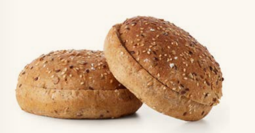
69856 CRISTAL SEEDED BURGER BUN 60 u / 2.46 oz / 5x8 / 20-30' Thaw / 4.48 In Vegan