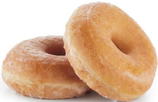
85591 LARGE GLAZED DOTSORIGINAL® 48 U | 2.47 OZ | 5 x 15 | 15-20" THE CLASSIC WITH A SUGAR GLAZE ON TOP. LARGE SIZE.