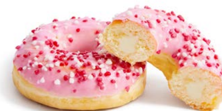
67124 PINK & WHITE FILLED DOTSORIGINAL®