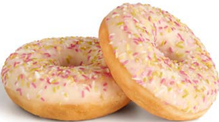
24260 CONFETTI DOTSORIGINAL® 36 U | 1.98 OZ | 10 X15 | 15-20' DIPPED IN WHITE ICING AND TOPPED WITH PASTEL-COLORED SUGAR SPRINKLES.