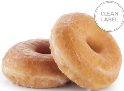
85151 GLAZED DOTSORIGINAL® 36 U | 1.83 OZ | 10 x 15 | 15-20" THE CLASSIC WITH GLAZED SUGAR ON TOP.