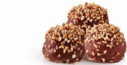
64225 COCOA & HAZELNUT POPDOTS ORIGINAL® 88 U | 0.63 OZ | 10 X16 | 15-20' COCOA & HAZELNUT POPDOTS COME DRESSED IN AN ELEGANT COCOA COATING AND SPRINKLED WITH ROASTED HAZELNUT KERNELS. JUST THAW AND YOU'RE READY TO EAT!