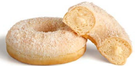
65144 ALMOND CRÈME & COCONUT DOTSORIGINAL®

FILLED WITH TASTY COCOA & HAZELNUT CREAM AND COVERED WITH A CRUNCHY SPRINKLING OF COOKIE PIECES AND TOASTED HAZELNUT.