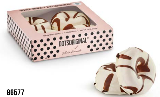
86577 WHITE DRIZZLE DOTSORIGINAL® 4 COUNT 18P X 4 U | 10.00 OZ 5 X12