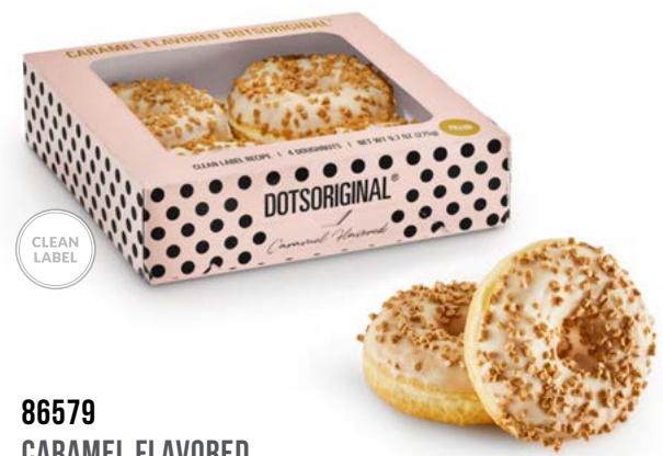
86579 CARAMEL FLAVORED DOTSORIGINAL® 4 COUNT 18P X 4 U | 9.7 OZ 5 X12