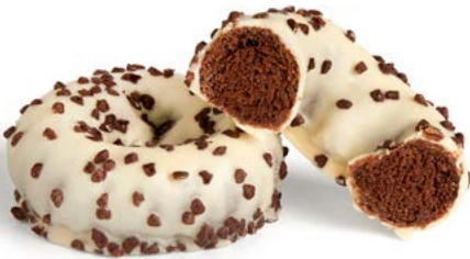
64920 DOTSORIGINAL® ON THE ROCKS 36 U | 3.10 OZ | 10 X15 | 15-20' EXQUISITE COCOA-LADEN CAKE DOUGH, COATED IN WHITE ICING AND TOPPED ALL AROUND WITH COCOA FLAVORED BITS.