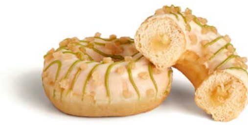
68765 APPLE FILLED DOTSORIGINAL® 36 U | 2.61 OZ | 10 X 15 | 20-25' FILLED WITH APPLE JAM AND HAVE A WHITE ICING COATING, TOPPED WITH SMALL PIECES OF JELLY APPLE BITS!