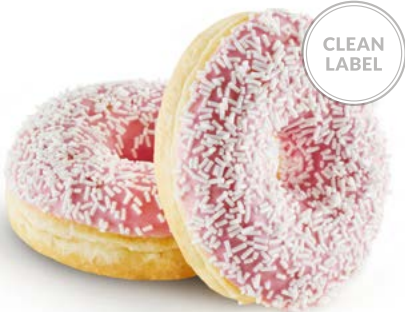
80668 PINK DOTSORIGINAL® 36 U | 2.12 OZ | 10 X15 | 15-20' DELICATE STRAWBERRY-FLAVORED GLAZE WITH WHITE SPRINKLES.