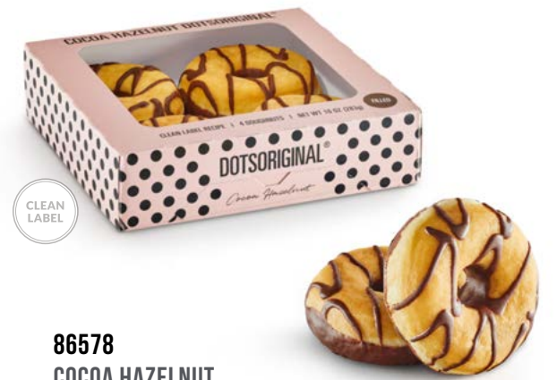
86578 COCOA HAZELNUT DOTSORIGINAL® 4 COUNT 18P X 4 U | 10.00 OZ 5 X12