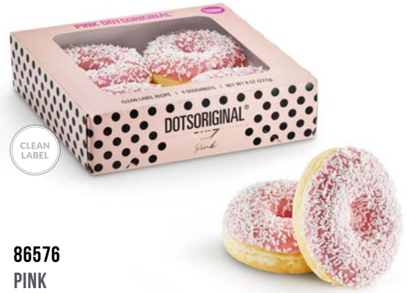
86576 PINK DOTSORIGINAL® 4 COUNT 18P X 4 U | 8.00 OZ 5 X12