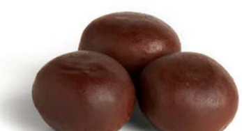
64220 COCOA POPDOTS ORIGINAL® 100 U | 0.56 OZ | 10 X16 | 15-20' SOFT, SPONGY POPDOTS ORIGINAL® COATED WITH COCOA.