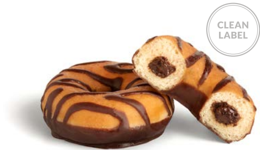
82919 COCOA & HAZELNUT FILLED DOTSORIGINAL® 36 U | 2.65 OZ | 10 X 15 | 20-25' FILLED WITH EUROPEAN-STYLE COCOA & HAZELNUT CREAM, DRIZZLED WITH DELICATE COCOA STRIPES.