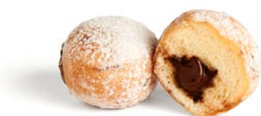
68739 POWDERED COCOA FILLED POPDOTS ORIGINAL® 108 U | 0.64 OZ | 10 X15 | 15-20' OUR NEW POPDOTS ORIGINAL® HAS A CREAMY CHOCOLATE INTERIOR AND FLUFFY DOUGH DECORATED WITH ICING SUGAR.