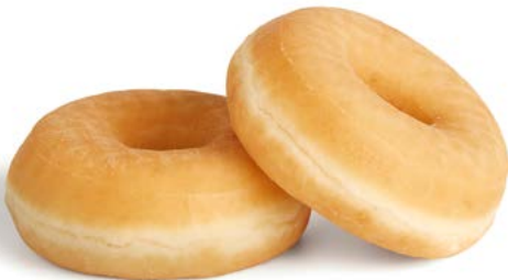
65520 PLAIN DOTSORIGINAL® 72 U | 1.55 OZ | 5 x 15 | 15-20" ARTISANAL APPEARANCE, UNCOATED AND UNFILLED, SO YOU CAN PERSONALIZE DECORATION AND FILLING AS YOU LIKE IT.