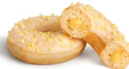
81145 LEMON FILLED DOTSORIGINAL®

FILLED WITH A SMOOTH WHITE ALMOND CREAM AND TOPPED WITH A WHITE ICING AND A GENEROUS LAYER OF SHREDDED COCONUT.