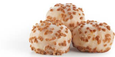
64235 WHITE CARAMEL FLAVORED POPDOTS ORIGINAL® 88 U | 0.78 OZ | 10 X16 | 15-20' THESE POPDOTS ORIGINAL® ARE TRULY AN EYE-CATCHER WITH ITS LAYER OF WHITE ICING AND CRUNCHY CARAMEL FLAVORED TOPPING.