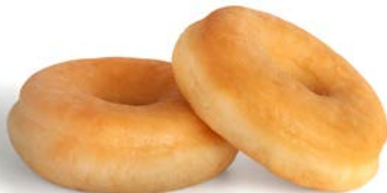
39880 PLAIN MINI DOTSORIGINAL® 65 U | 0.78 OZ | 10 x 11 | 10-15" OUR CLASSIC DOTS, MADE BITE-SIZED! SOFT DOUGH WITH NO DECORATIONS, MAKING IT IDEAL FOR CUSTOMIZATIONS.