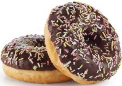
83084 SPRINKLED COCOA DOTSORIGINAL® 36 U | 1.94 OZ | 10 X15 | 15-20' DECORATED WITH A LAYER OF DARK COCOA FLAVORED COATING AND PASTEL-COLORED SPRINKLES ON TOP.