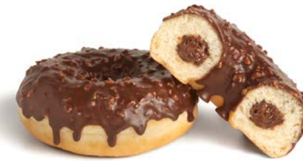
65164 COCOA CRUNCH FILLED DOTSORIGINAL®