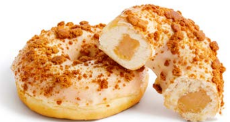
65401 LOTUS BISCOFF® FILLED DOTSORIGINAL®