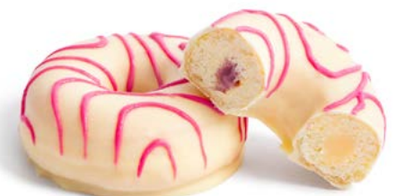
67439 RASPBERRY & CHEESECAKE FILLED DOTSORIGINAL®