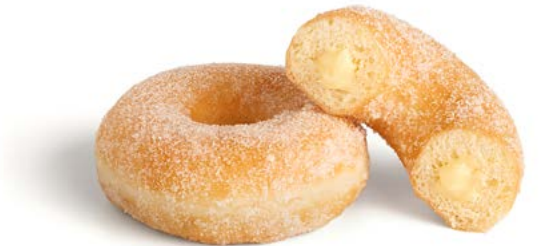
61293 CUSTARD FLAVORED FILLED SUGARED DOTSORIGINAL® 36 U | 2.47 OZ | 10 X 16 | 20-25' SOFT DOUGH, CUSTARD-FLAVORED CREAM, TOPPED WITH REAL GRANULATED SUGAR.