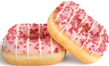
60115 PINK SQUARE DOTSORIGINAL® 36 U | 2.26 OZ | 10 X14 | 15-20' UNIQUE SQUARE SHAPE, WITH STRAWBERRY-FLAVORED TOPPINGS AND DRIZZLED WITH WHITE ICING.