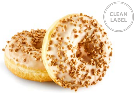
86153 CARAMEL FLAVORED FILLED DOTSORIGINAL® 36 U | 2.57 OZ | 10 X 16 | 20-25' WITH A CREAMY CARAMEL-FLAVORED FILLING. THE WHITE ICING ON TOP IS HIGHLIGHTED WITH A CRUNCHY CARAMEL-FLAVORED TOPPING.