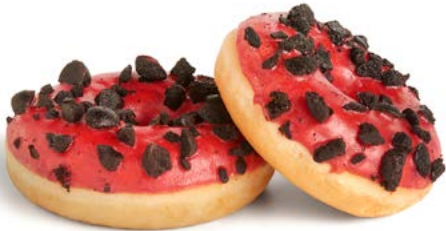
61175 RED COOKIE CRUMBLES DOTSORIGINAL® 36 U | 2.1 OZ | 10 X13 | 15-20' CHEESECAKE-FLAVORED COATING TOPPED WITH CHOCOLATE COOKIE CRUMBLES.