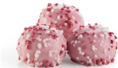
64245 PINK POPDOTS ORIGINAL® 88 U | 0.74 OZ | 10 X16 | 15-20' THEIR ATTRACTIVE COATING, WITH STRAWBERRY AND CREAM-FLAVORED SPRINKLES, IS IRRESISTIBLE.