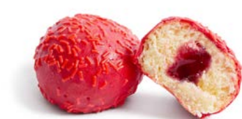
84392 MIXED BERRIES FILLED POPDOTS ORIGINAL® 80 U | 0.905 OZ | 10 X17 | 30-40' FUN & FLAVORFUL MIXED BERRIES POP DOTS ORIGINAL® HAS A SOFT CENTER WITH A SWEET BERRY FILLING THAT MAKES THEM IRRESISTIBLE.