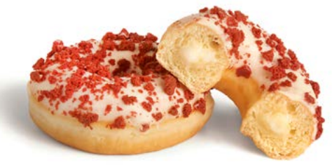
67180 RED VELVET DOTSORIGINAL® 36 U | 2.61 OZ | 10 X 15 | 20-25' YOGURT CREAM FILLED, COVERED WITH WHITE ICING AND TOPPED WITH RED VELVET COOKIE BITS.