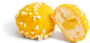
84391 LEMON FILLED POPDOTS ORIGINAL® 80 U | 0.935 OZ | 10 X17 | 30-40' MEET OUR SPECIAL FILLED LEMON POP DOTS ORIGINAL® WITH A BRIGHT, COLORFUL COATING BURSTING WITH ZESTY LEMON IN EVERY BITE. IT IS SURE TO AWAKEN YOUR SENSES.